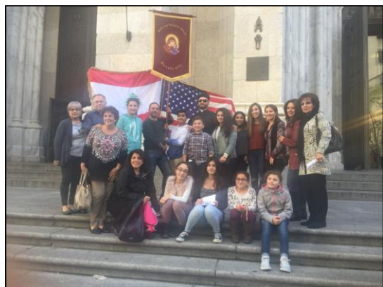
St. Charbel's Chapel Dedication St. Patrick's Cathedral- New York October 28, 2017